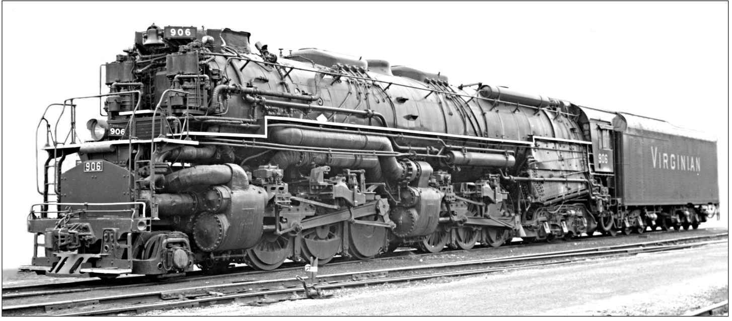
be Dulux Yellow in color. The road numbers available are 900 thru 907 inclusive.