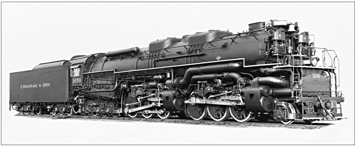
Version #2: will model the last prototype order of the class, available with road numbers from 1645 thru 1659 inclusive, this version will have the builder installed overfire jets on the firebox and is essentially unchanged from it's original configuration.