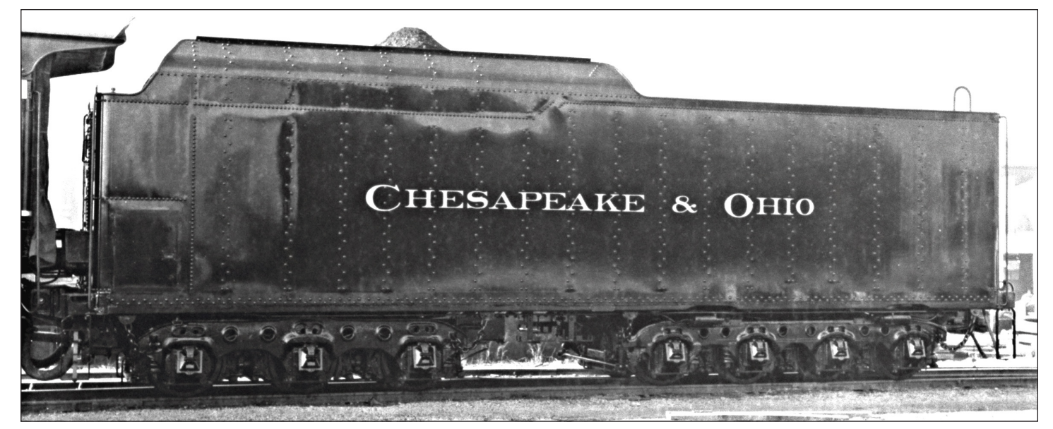
sion that has never been offered before and it is limited to ten (10) models.

To anticipate one of the most frequently asked questions regarding which version has more detail, all of our versions will have comparable detailing with no one version having significantly more than any other. The version differences will be in the style or type of detail rather than quantity. Your version choice may be made without concern that the wrong selection will leave you with a model of lessor detail.